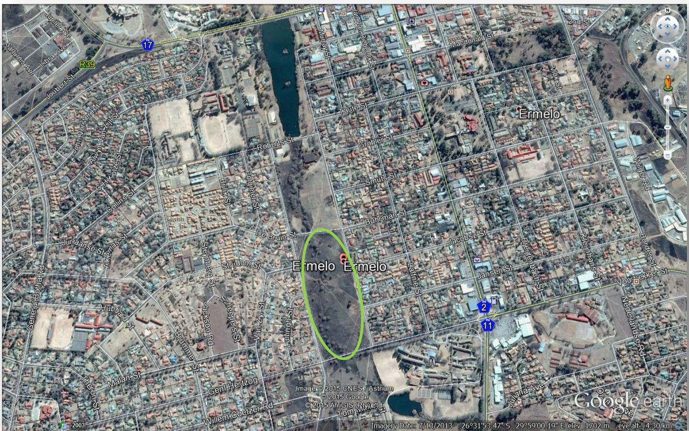
Figure 1: Locality of the proposed shopping centre development (green circle)

GTF Trust received authorisation in 2010 for the establishment of a residential township on portion 13 and 188 (Extension 39 and 40) on the farm Nooitgedacht 268-II.